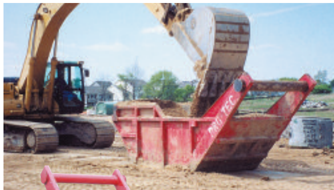
Above Stone Saver shown with option extension.

steel plate. Weld seams and sharp edges are